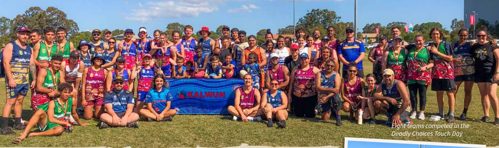
Eight teams competed in the Deadly Choices Touch Day