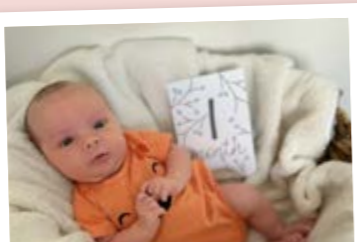
Jasper – son of Moesha and Lachlan born 30th September