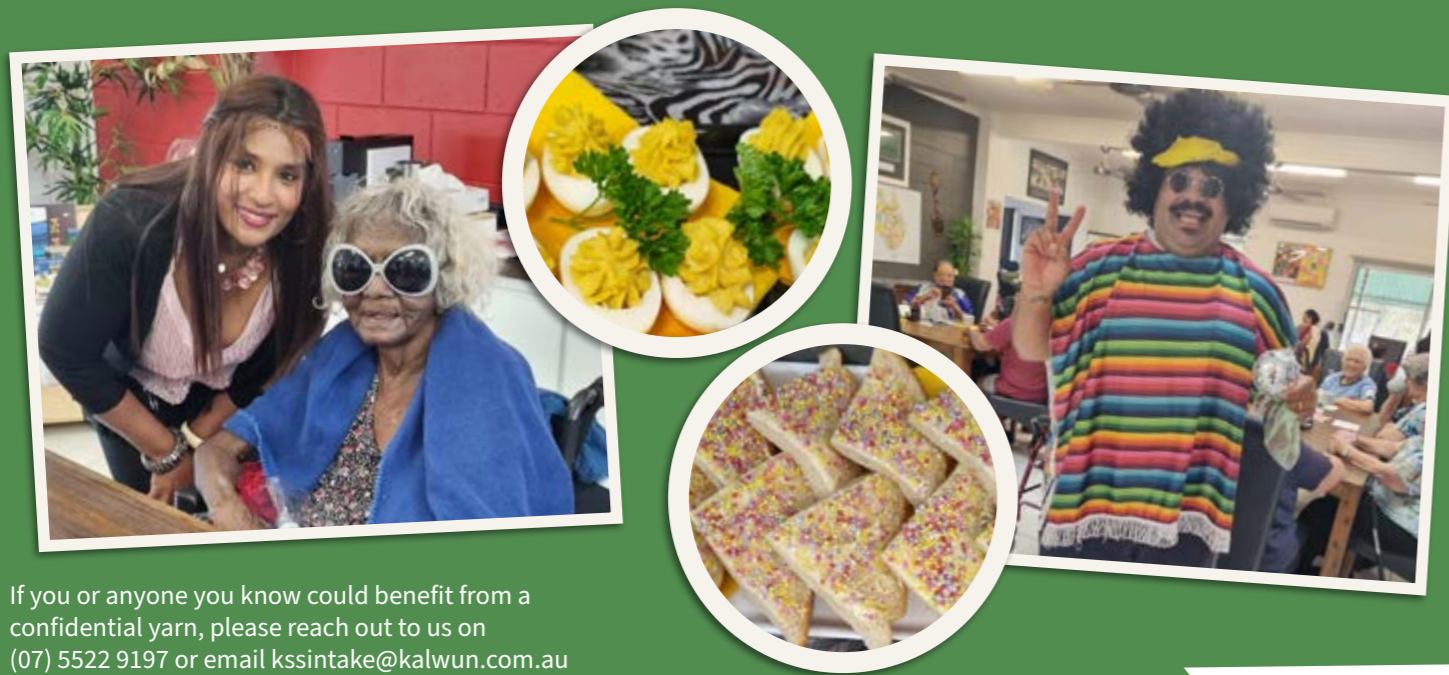
If you or anyone you know could benefit from a confidential yarn, please reach out to us on (07) 5522 9197 or email kssintake@kalwun.com.au

The success of the event highlighted the Wellness Centre's commitment to not only meeting the physical and medical needs of its clients but also creating a second home filled with friendships and treasured memories. In a world that often rushes forward, this groovy event was a reminder to savour the simpler joys of life and cherish every moment.